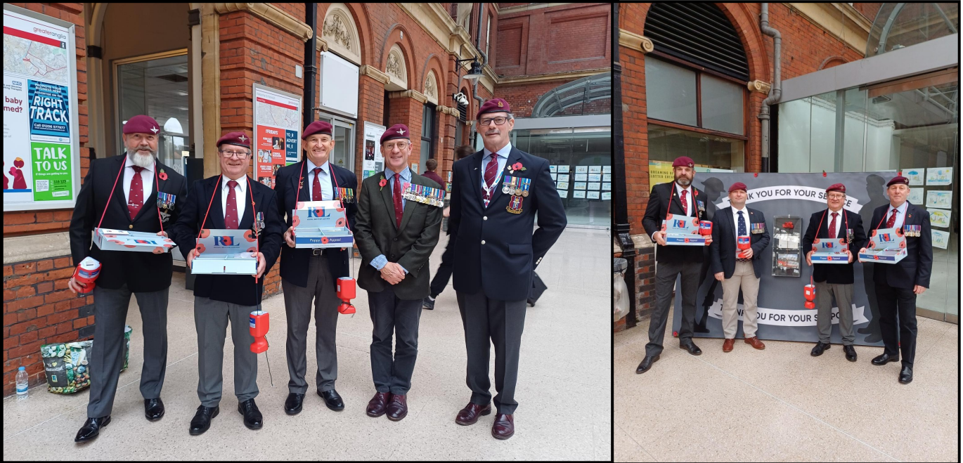
The Branch collection teams

In November, they did their bit for the Poppy Appeal and raised the profile of the PRA by collecting at Norwich Train Station over 2 Saturdays. In the space of 10 hours they managed to raise just over £2100.00, an amazing achievement by all accounts. It must be something to do with the pulling power of the Maroon Machine!