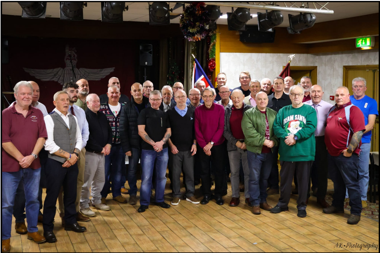
Branch Group Photo Christmas 2024