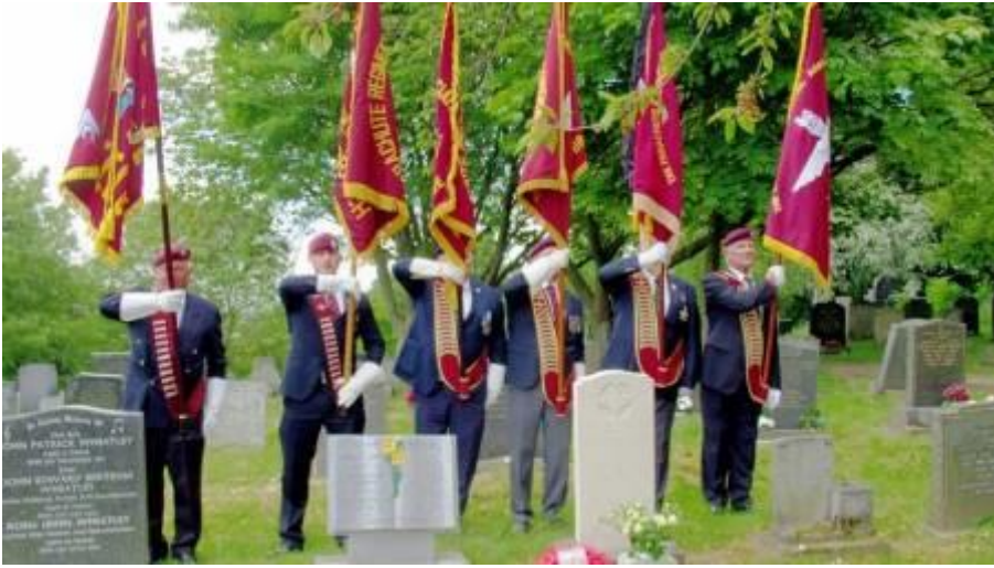
Branch Standards on Parade