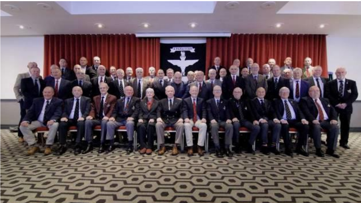
4 Para Reunion Members on Parade

Next year's reunion will be held again in the Hilton City Hotel Saturday 27th April 2024.