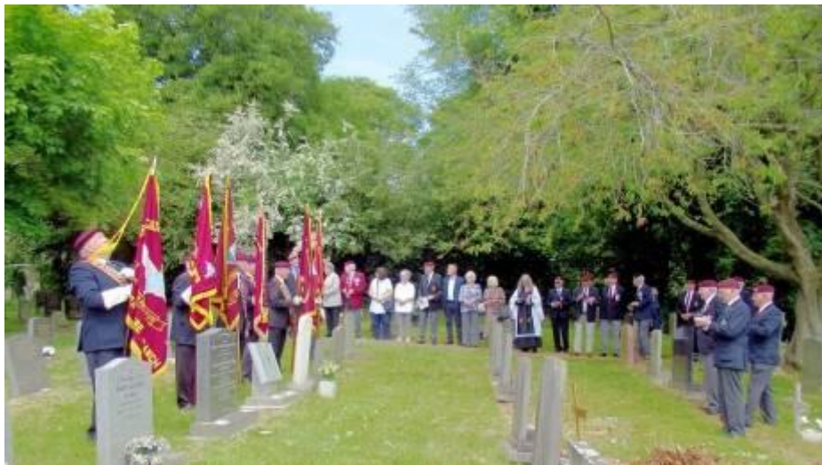
The Service of Remembrance

The event was organised by the Nottingham and Newark branches, with other branch members and Standards there to support the day.