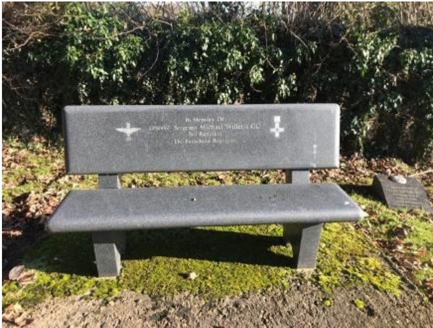
The Memorial Bench