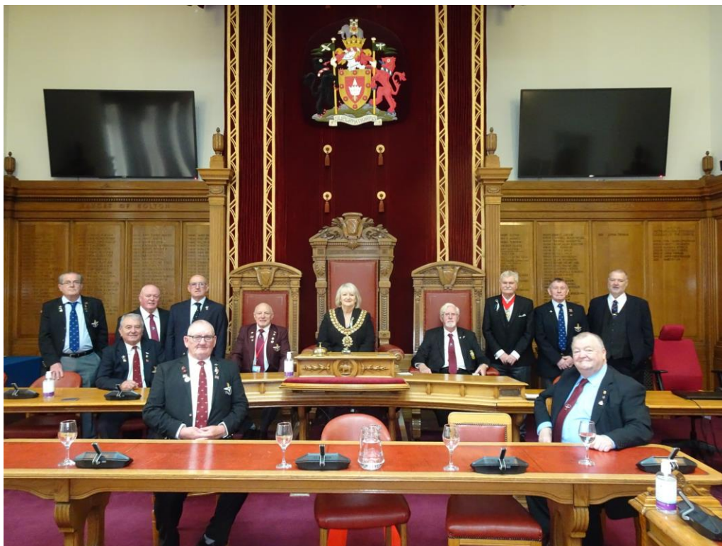
The Lady Mayor and the Bolton Branch Members