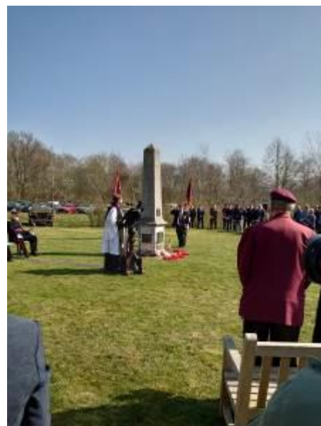
The memorial and wreath laying