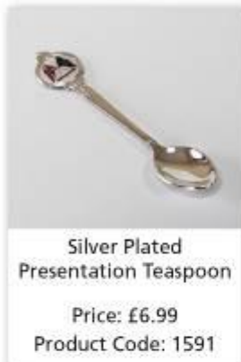
Silver Plated Presentation Teaspoon