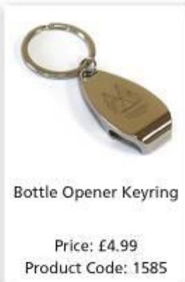
Bottle Opener Keyring