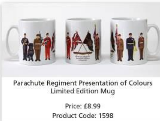
Parachute Regiment Presentation of Colours Limited Edition Mug