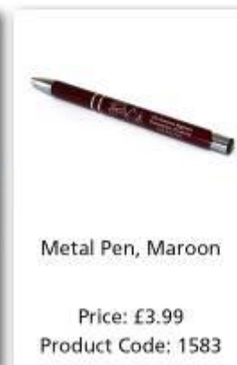
Metal Pen, Maroon