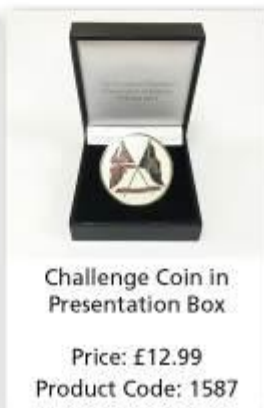
Challenge Coin in Presentation Box