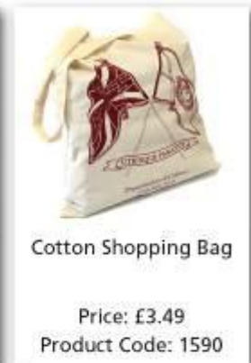
Cotton Shopping Bag