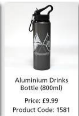
Aluminium Drinks Bottle (800ml)