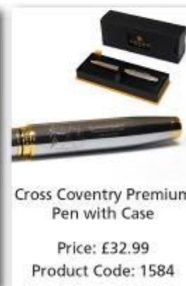
Cross Coventry Premium Pen with Case